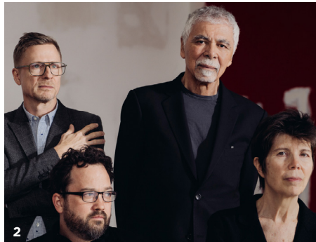
Diller Scofidio + Renfro