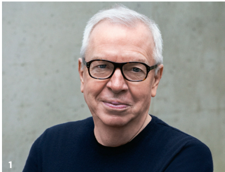
David Chipperfield Architects

Link to download images: tinyurl.com/yc7w23n2