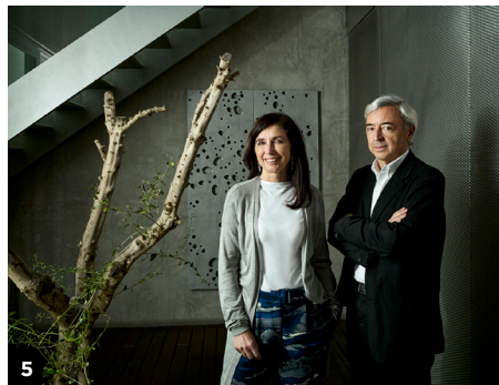
Nieto Sobejano Arquitectos