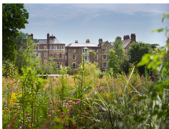
Images, clockwise left to right: Jacqueline du Pré Music Building; river Cherwell frontage; St Hilda's from the University of Oxford Botanic Garden; current entrance configuration.