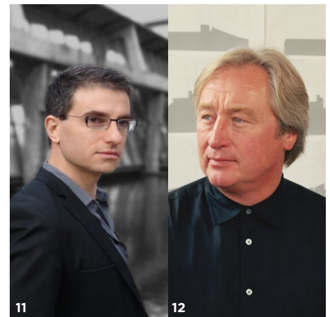
11 Team Steven Holl Architects and Conrad Gargett