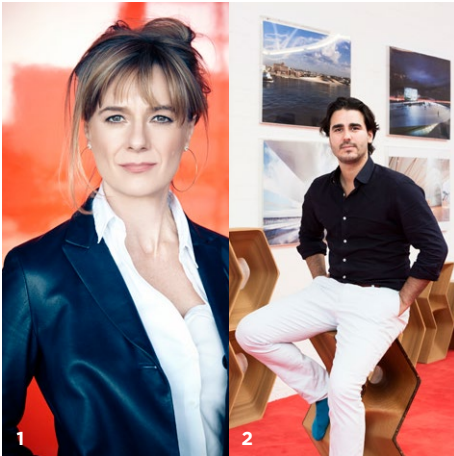
1 Team AL_A and Architectus