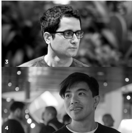
3 Team Bernardes Architecture and Scale Architecture