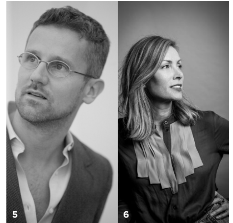
5 Team BVN Architecture and Carlo Ratti Associati